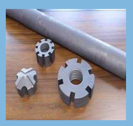
Product Display and Use