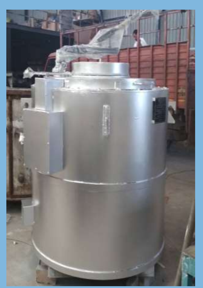
Product Display and Use