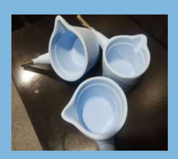
Product Display and Use